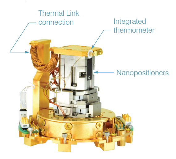
Image shows the X130 Integrated Nanopositioners with the X132 Thermal Link option and integrated thermometer.

Quantum Design has created a custom Thermal Link for use with Integrated Nanopositioners. The Thermal Link effectively cools your sample while providing full mobility for linear positioner motion in X, Y, and Z. The high-A/L design is optimized for cooling at high magnetic fields where magnetoresistance reduces the effectiveness of other high-RRR thermal links. The Thermal Link comes with a built-in thermometer to give you an accurate temperature reading close to your sample without impacting clearance. The X132 Thermal Link is included with the X130 Integrated Nanopositioners or it can be purchased separately for use with other positioner stacks.