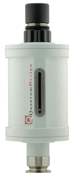
Linear Transport Motor