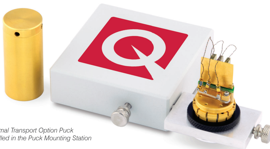
Thermal Transport Option Puck installed in the Puck Mounting Station