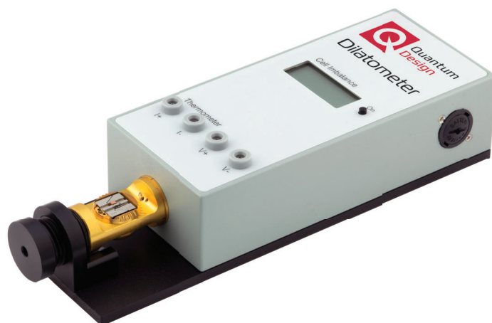
Dilatometer Capsule installed in the Balance Meter

Specifications are subject to change without notice.