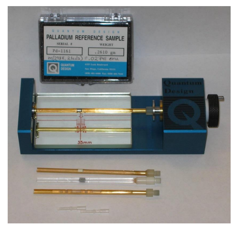
Quantum Design supplied sample holders and PPMS-VSM mounting station.