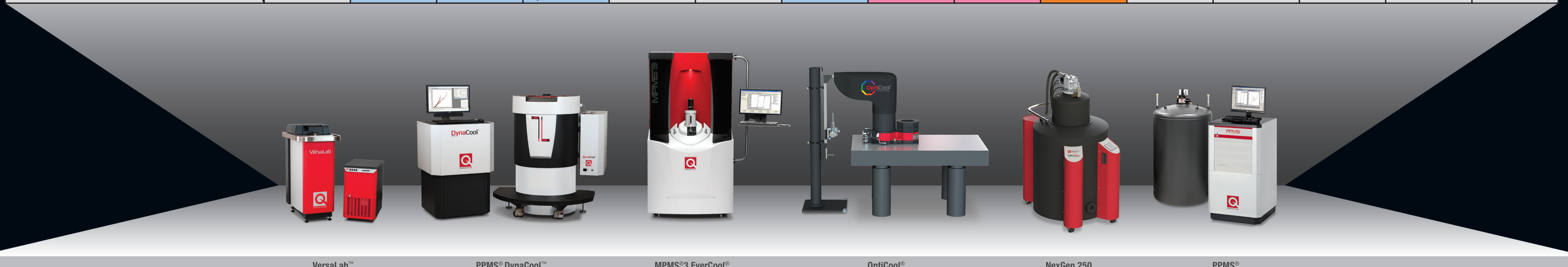
VersaLab™ Temperature: 50 K – 1000 K Field: ± 3 T PPMS® DynaCool™ Temperature: 50 mK – 1000 K Field: ± 9 T, ± 12 T, ± 14 T MPMS®3 EverCool® Temperature: 0.5 K – 1000 K Field: ± 7 T OptiCool® Temperature: 1.7 K – 350 K Field: ± 7 T NexGen 250 Liquefaction Rate: 25+ Liters / Day Capacity: 250 Liters PPMS® Temperature: 50 mK – 1000 K Field: ± 9 T, ± 14 T, ± 16 T