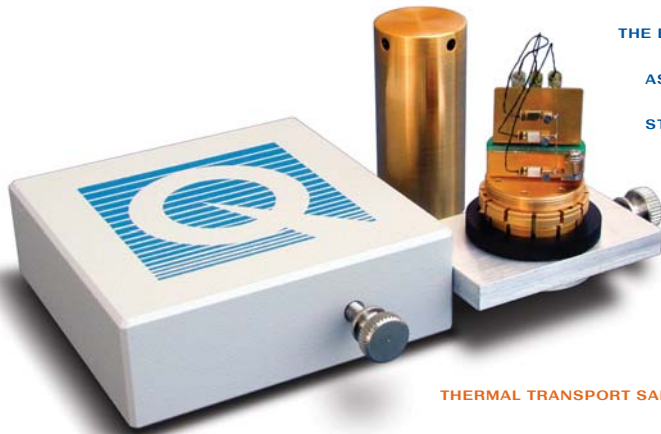
THERMAL TRANSPORT SAMPLE STATION

IN MEASURING THE THERMAL TRANSPORT PROPERTIES OF A MATERIAL SPECIMEN - SUCH AS THERMAL CONDUCTIVITY \kappa AND SEEBECK COEFFICIENT \alpha - A RESEARCHER CAN LEARN CONSIDERABLE INFORMATION ABOUT THE ELECTRONIC AS WELL AS THE IONIC LATTICE STRUCTURE OF THAT SPECIMEN.