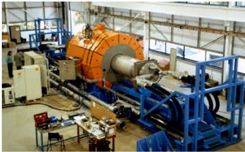
A large-capacity superconducting magnetic separator on final test in 1997

This type of system has been used since 1989 in the china clay industry with ever-larger processing capacities as the magnet technology has progressed. This application of HGMS has proved to be a reliable, commercially viable technology with more than 50 systems operating in the field with no operational failures. Indeed the first commercial system, manufactured in 1989, is still operating to this day in Cornwall, England. Many of the operational systems are situated in remote regions of the world such as rural India or the Amazon rainforest in Brazil.