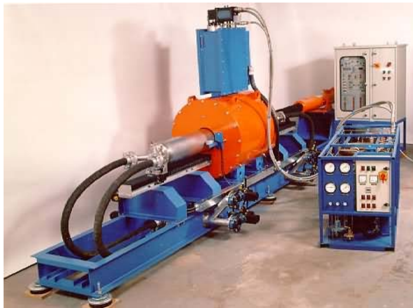
The first modern-type superconducting magnetic separator for kaolin improvement in 1989

This type of machine constituted a huge step forward for the technology. Further improvements were made as superconductor and cryogenic technology improved to enable the modern state-of-the-art system for china clay treatment, as illustrated in the next photograph. This type of system operates constantly with minimal “dead time”, is extremely compact and once commissioned and energised, the superconducting magnet requires no attention except periodic liquid helium filling and servicing of ancillary systems.