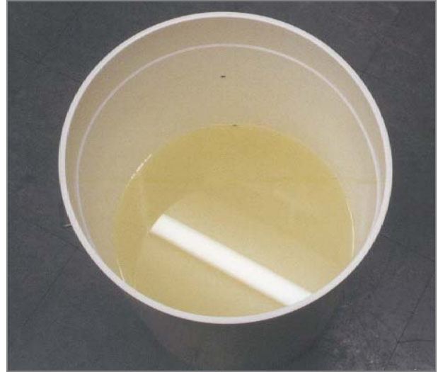
Demonstration of the removal of grinding swarf from machining fluid from a large-scale industrial facility using superconducting magnetic separation

Many other industries can benefit from similar systems. The plating industry is one possibility where very fine particles of precious metals such as gold, silver and platinum are lost in rinse water and introduced into the environment.