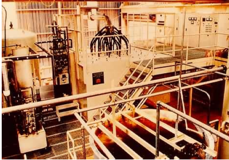
The first superconducting magnetic system for kaolin improvement in 1986

This type of machine constituted a huge step forward for the technology. Further improvements were made as superconductor and cryogenic technology improved to enable the modern state-of-the-art system for china clay treatment, as illustrated in the next photograph. This type of system operates constantly with minimal “dead time”, is extremely compact and once commissioned and energised, the superconducting magnet requires no attention except periodic liquid helium filling and servicing of ancillary systems.