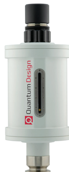
Linear Transport Motor.